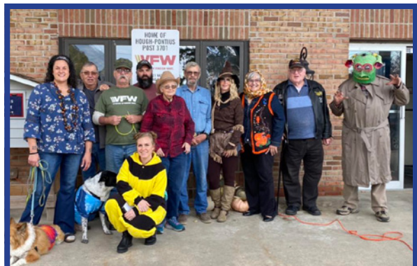
Members dress up for annual Halloween event at the Post