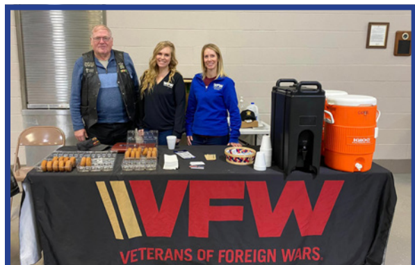
Members offer free coffee & donuts to soldiers of the 1073rd Maint. Co.

Veterans Crisis Line 1-800-273-8255 PRESS 1