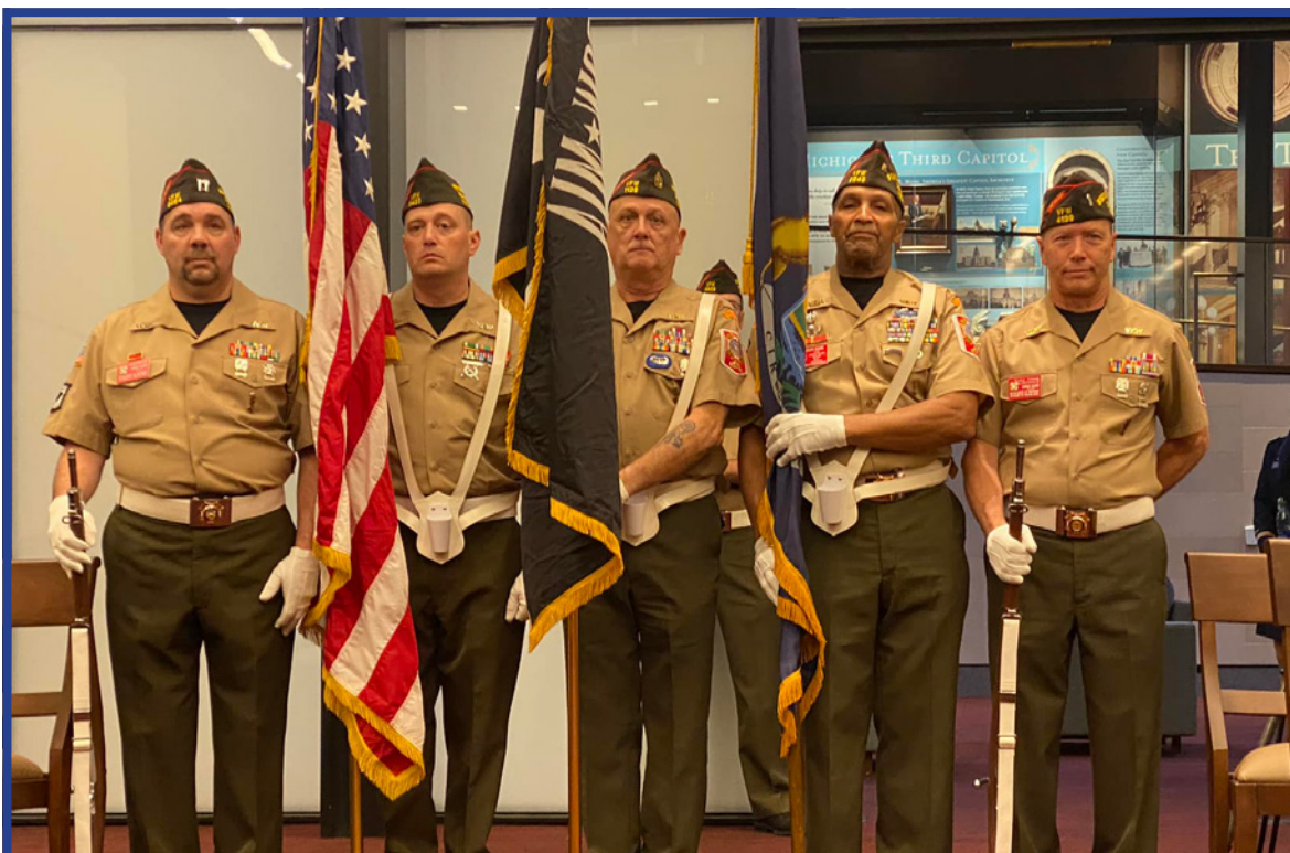
VFW Department of Michigan State Honor Guard Post the Colors at the State of Michigan Veterans Affairs Veterans Day Ceremony